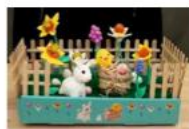
A miniature spring garden in a seed tray