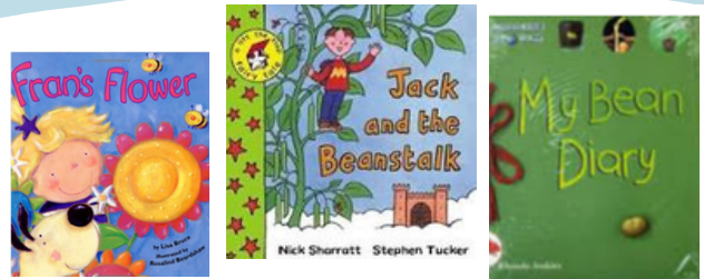
OUR TEXTS FOR THIS HALF TERM

We develop fine motor and gross motor skills, working both indoors and outside. In PE sessions we will practise our athletics skills, preparing for our Sports Day next half term. For our fine motor skills, we continue to strengthen our fingers, using tools and equipment accurately and safely, such as, threading, cutting, tracing and mark making.