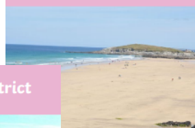
The Peak District