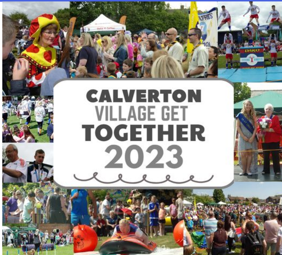
Free Funfair Rides | BBQ | Bar | Stalls | Arena Performances | Donkey Rides

On the 14th May, the village will hold its annual Village Get Together. This year the theme is 'Calverton by the Sea'. St Wilfrid's will be participating in a pirate themed dance and we encourage as many children as possible to parade with us. St Wilfrid's will also be running its own stall. Come and support us if you can! The parade will start at 11:30am from the William Lee building..