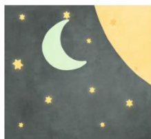
day four - sun, moon, stars