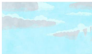
day two - sky