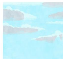
day seven - rest, Sabbath God