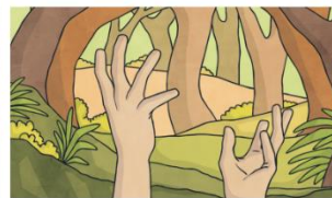
day three - land, water, plants