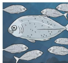
day five - fish, birds