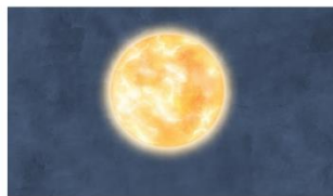
day one - heavens earth light