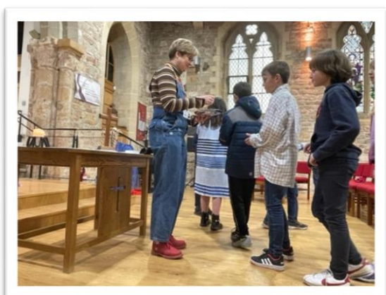
Children receive RE lessons both in school and in our local church.